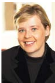
Bradford & Bingley